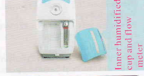
Inner humidified cup and flow meter