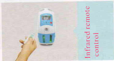
Infrared remote control