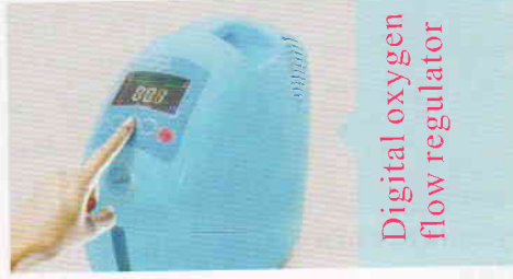
Digital oxygen flow regulator