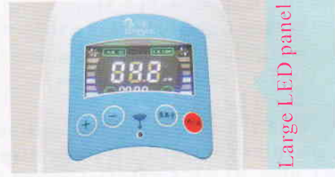
Large LED panel